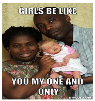
Girls be like "you my one and only" (Anonymous 2013b)