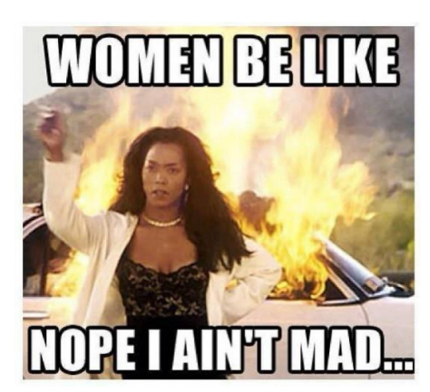
Women be like "nope I ain't mad" (Anonymous 2015b)