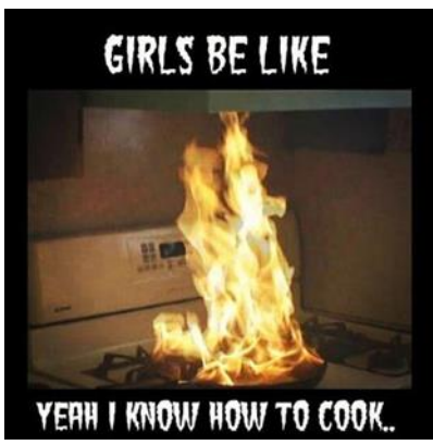
Girls be like "yeah, I know how to cook" (Anonymous 2013a)