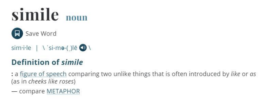
Figure 6: Definition of Simile (Merriam-Webster 2018)

It is at this point that the reader is made aware that the authors do not seem to know what a simile is or how to use that word appropriately. Secondarily, the reader is made aware that the book does not take into account the fact that "-wi/-wy is the masculine dual form in "mdw ntr and has nothing to do with 'the sun' (Allen 2014, Gardiner