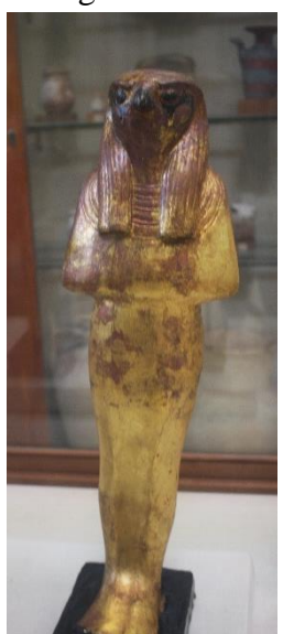
Figure 4: Figurine of Old R<sup>c</sup> 'Ra' in the Egyptian Museum

and was often described as 'the One and only One without a second whose names are manifold and innumerable" (Osei, Issa and Faraji 2020:15). Troublingly, the authors write "Amon is a variation of Amen while Wi and Ra constitute appellations for Amen" (Osei, Issa and Faraji 2020:39). Firstly, Old Rc 'Ra,' is not an "appellation" but is the Ntr 'Netcher (Divinity)' associated with 'the sun,' who was seen as being on par with Imm 'Amen (The Hidden One).' Thus the amalgamation of the two as Imm 'Amen (The Hidden One).' Amen Ra Niswt Netcheru (King of Divinities)' as clearly inscribed