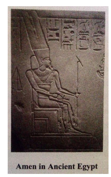
Figure 3: Image from the book (Osei, Issa and Faraji 2020:15)

have been. Further, the hr 'Heru' name of every other ruler, which also appeared in a srh 'serekh' would also have to be dealt with in the same way—an unwieldy proposition.